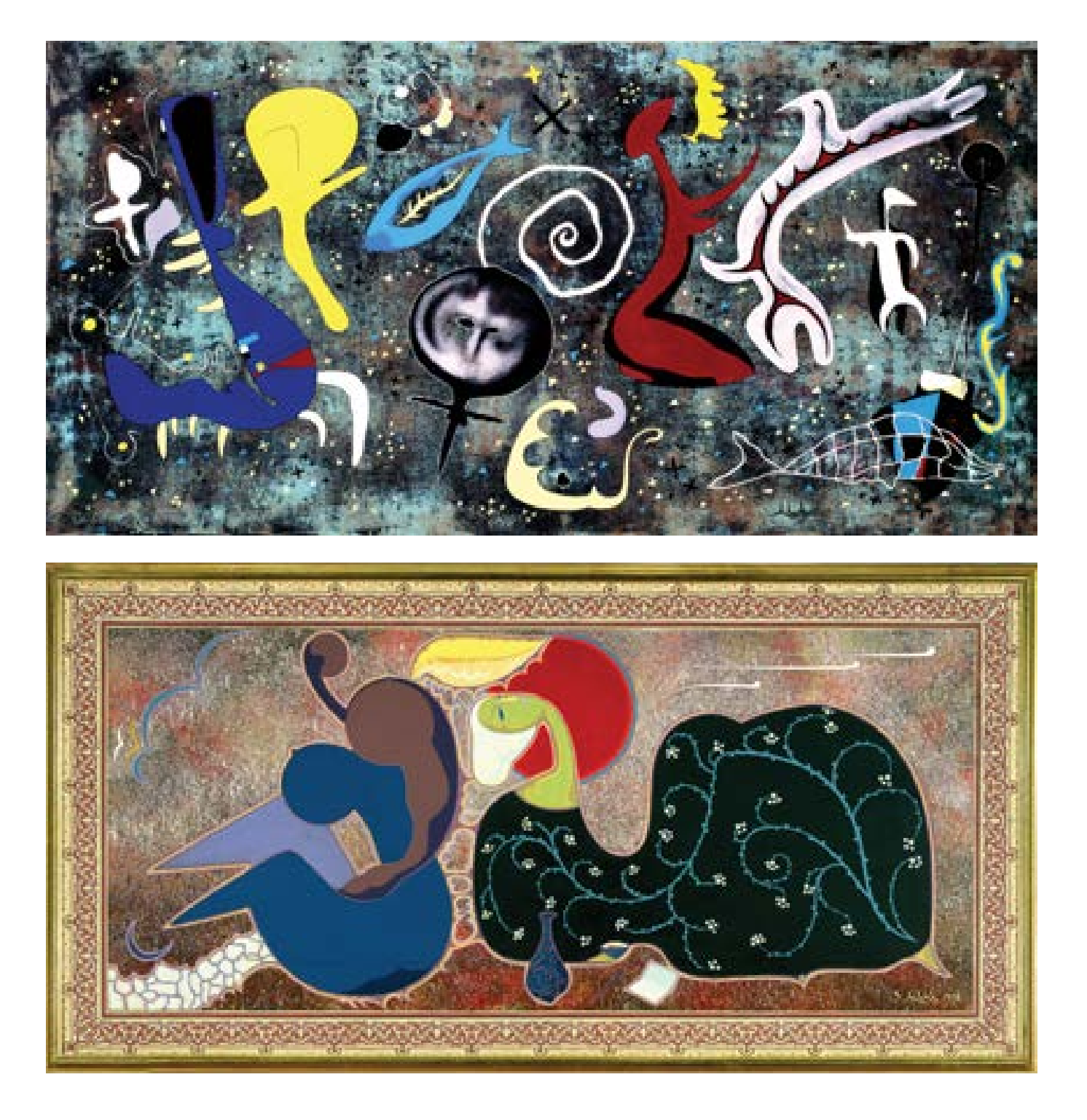
1). Life Cycle, 1996, acrylic on canvas, 80x160cm. 2) Poet and Muse